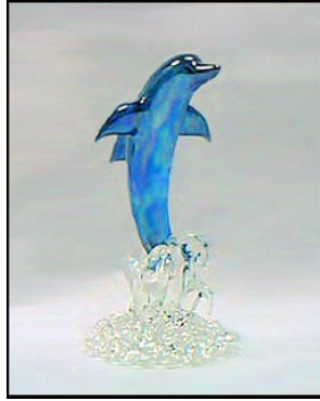
Rainbow Oil Slick Blue Dolphin